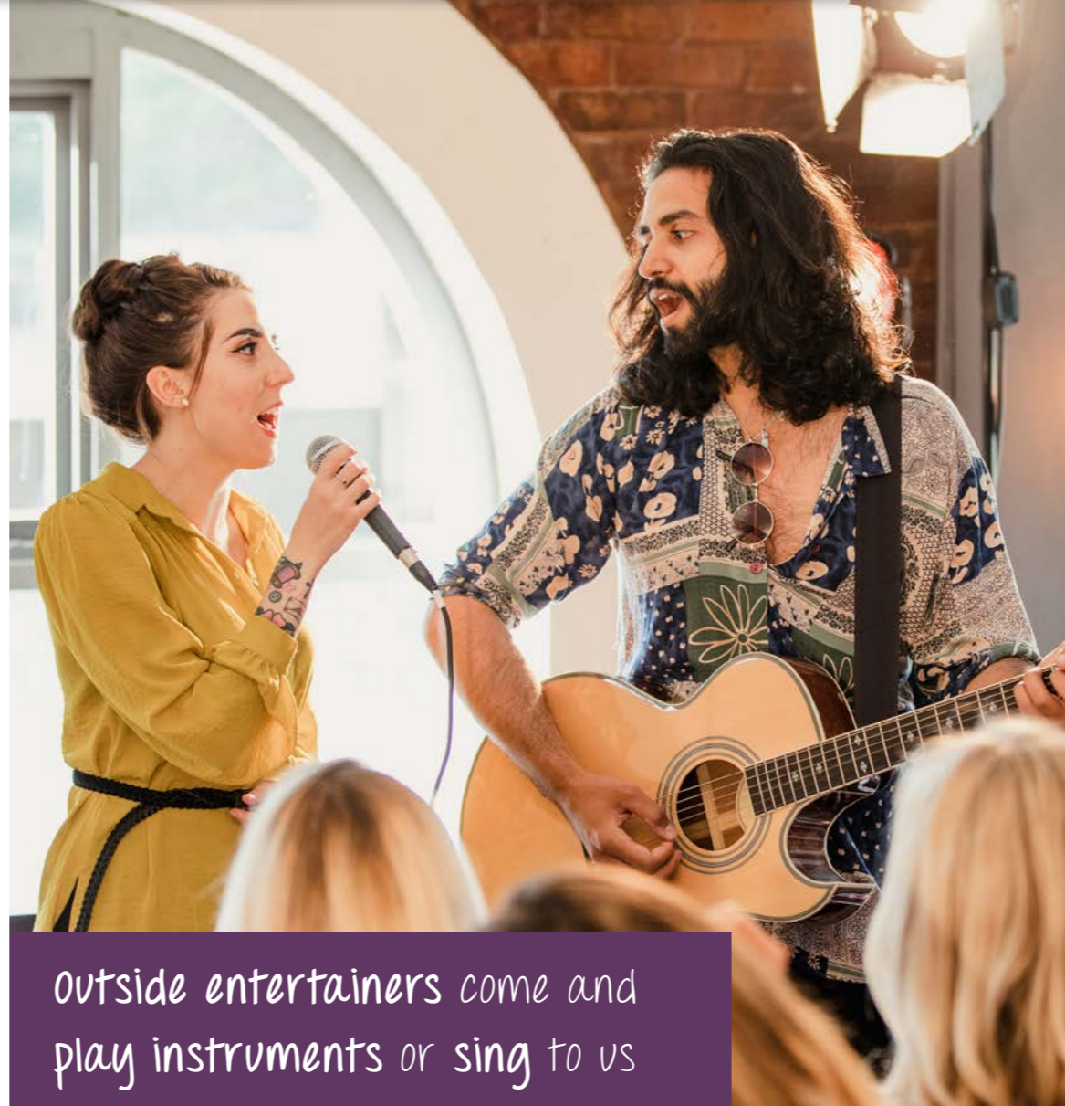
outside entertainers come and play instruments or sing to us