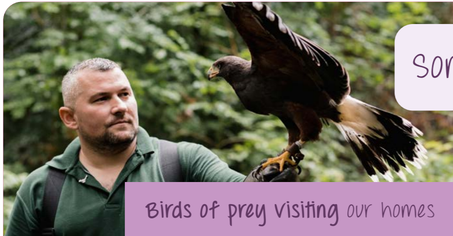
Birds of prey visiting our homes