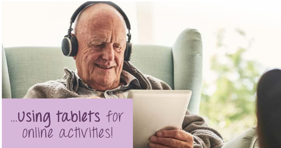
...Using tablets for online activities!