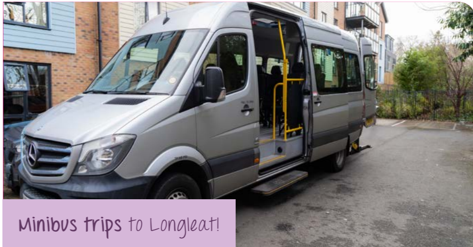
Minibus trips to Longleat!