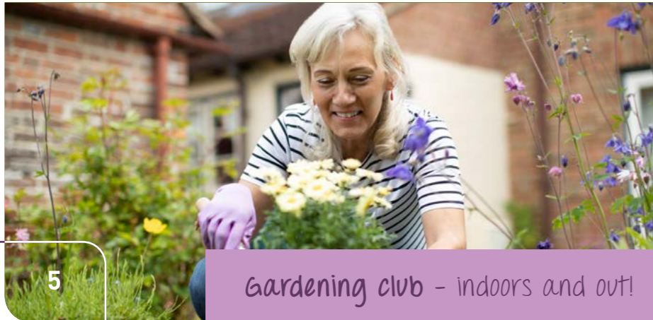
Gardening club - indoors and out!